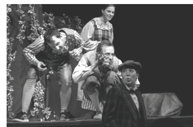
Rochester Children's Theatre performs Wind in the Willows

Auditorium events included academic lectures, music concerts, movie showings, children's entertainment, theatrical productions and dance ensembles. Auditorium performances provided a wide range of genre types while representing various viewpoints from many unique and interesting backgrounds.