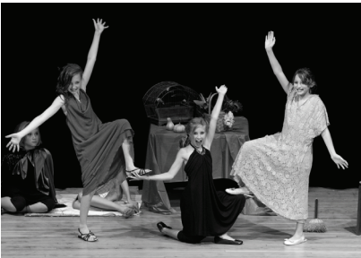
Town of Wellsville Youth Theater Performance

2010 marked the culmination of a community-wide effort to improve overall services at the library. Following four years of raising funds, implementing construction, developing programs and enhancing services, the library and its representatives received several regional and state awards for recent successes.