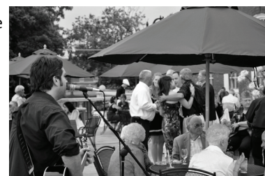
An Evening of Elegance and Sound was the theme at this summer's fund raiser.

Over the years the Friends have worked tirelessly to raise funds, host events and present programs that enhance the overall mission of the library and the quality of life in Wellsville.