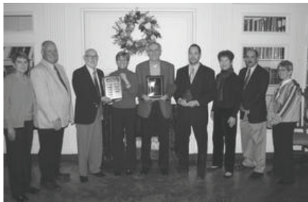
Library Administrators Display Recent Awards

Lastly, the library itself was awarded the New York State Public Libraries Building Construction Award through the New York Library Association for undergoing significant restoration that en-