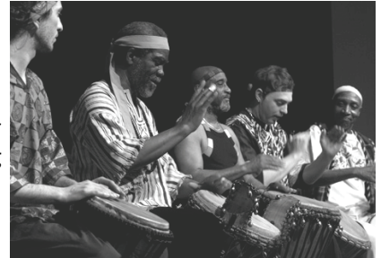
Sankofa Music Concert and Dance Ensemble

The library is very thankful for the many efforts and ongoing support of community members, local businesses and civic groups who understand that supporting a public library is an investment, not a donation. The David A. Howe Public Library is very proud to share these awards with our community. A library is only as good and as strong as the community it serves.